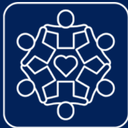
Diverse & Inclusive