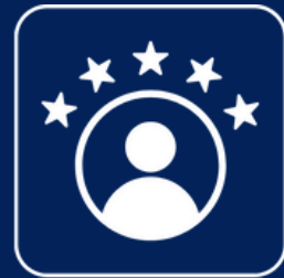
Caring For People